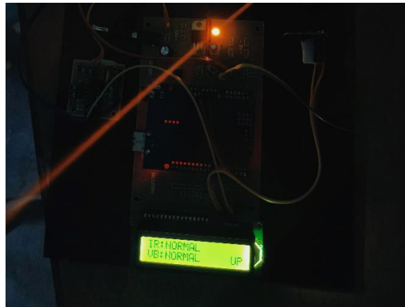
Figure:5 LCD Display in Normal State of Sensors

IR sensor in OFF condition and vibration sensor in ON condition which means theft has taken place. The vibration sensor will get ON when an unknown vibration occurs.