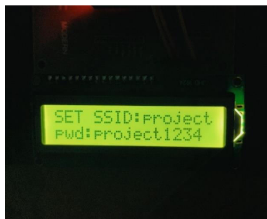
Figure:4 Wifi Access Display

IR sensor in ON condition and Vibration sensor in OFF condition which means no theft has taken place. The IR sensor will be in ON state as long as the object is present. Once if the object is removed, the IR sensor will get turns OFF.