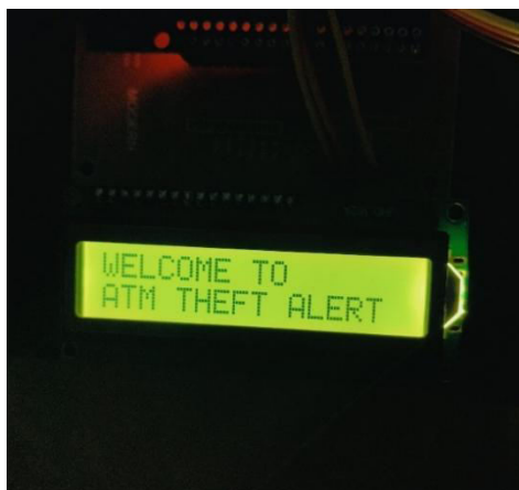
Figure: 3 Welcome Display

When the system is switched ON, the title gets displayed.